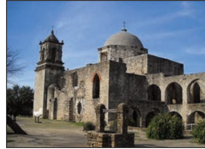
Mission San Jose