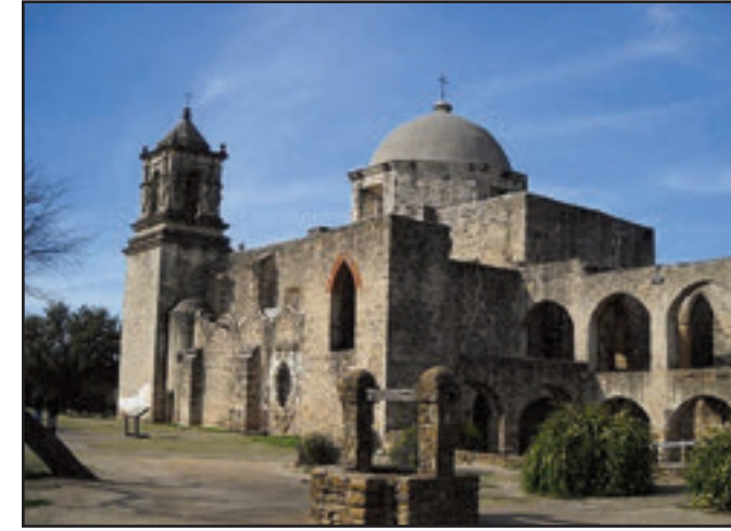
Mission San Jose