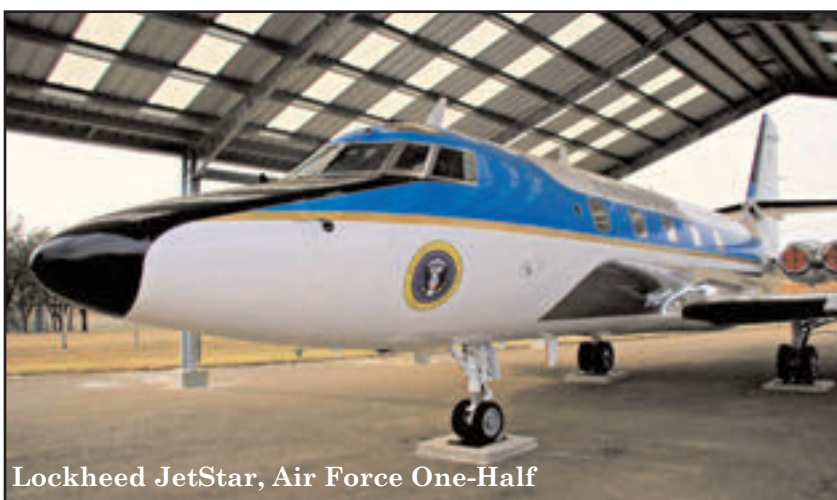
Lockheed JetStar, Air Force One-Half