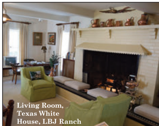
Living Room, Texas White House, LBJ Ranch