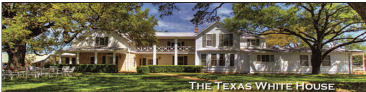
THE TEXAS WHITE HOUSE